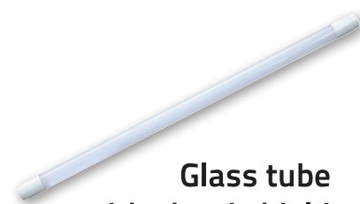
Glass tube with shard shield